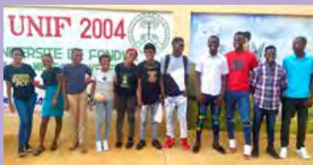
First day of classes at University Fondwa!