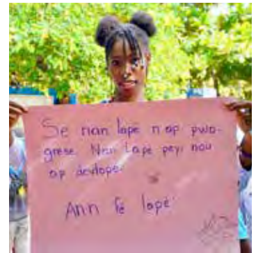
It's in peace we will progress. With peace our country will develop.