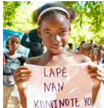
Peace in Our Communities