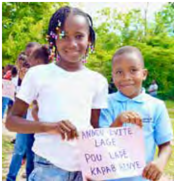
Let's Avoid War So That Peace Can Reign