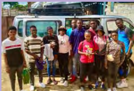
Arriving at University Fondwa.