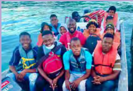
Taking the boat to Miragoâne.