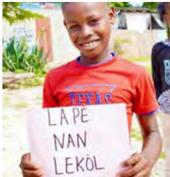
Peace in School

The Matènwa Community Learning Center celebrated the International Day of Peace in September with our 330 students and dozens of teachers parading down the street with slogans like these: